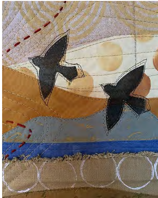
From Sea to Sky and Back Again